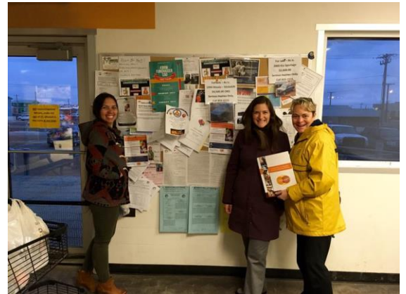
Team in grocery store in Barrow posing beside posted flyers of CHAMPS events

team also spent time with WIC staff and Screening for Life program.