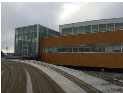
Samuel Simmonds Memorial Hospital in Barrow

Breastfeeding: How It Is All Connected” and “Step by Step to the 10 Steps” at the Samuel Simmonds Memorial Hospital, and met with members of the Arctic Slope