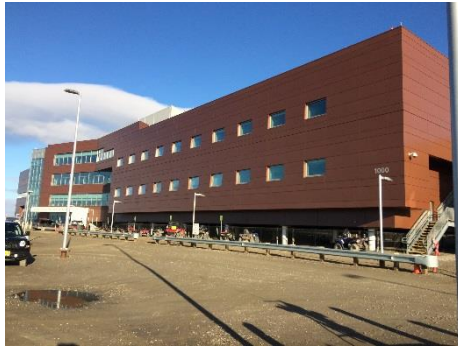
Norton Sound Hospital in Nome