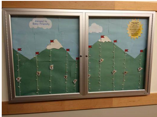
Board at ANMC with mountain climbers representing progress toward each of the 10 steps to Baby-Friendly™ Designation